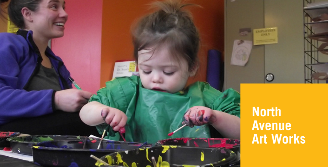
North Avenue Art Works