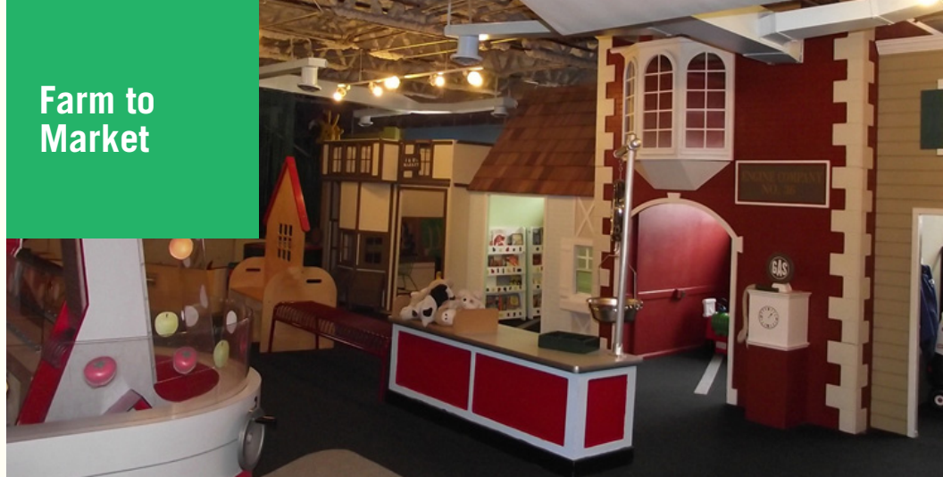
Farm to Market