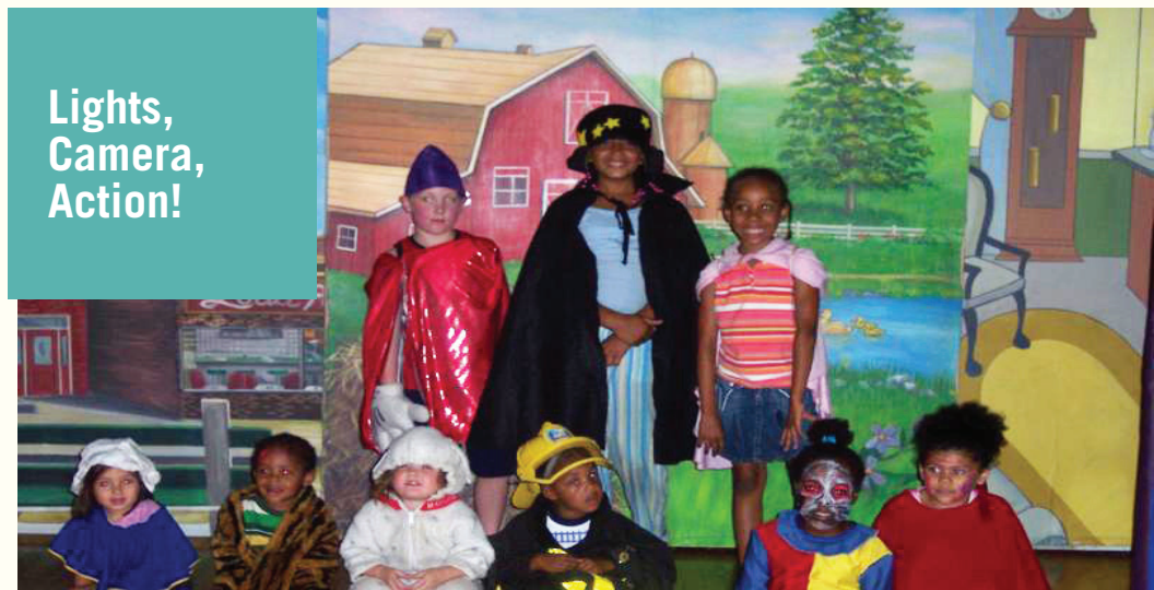
Lights, Camera, Action!